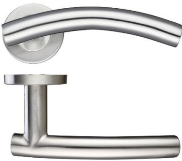
ASP16194 - Bar Arched Lever