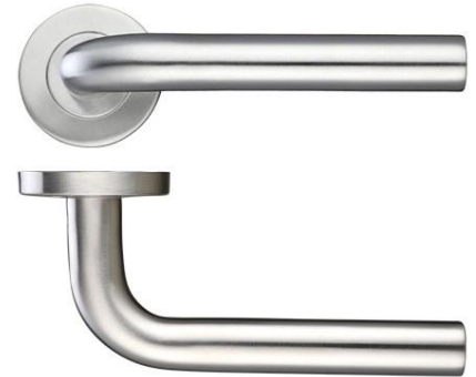
ASP13194 - Straight Lever