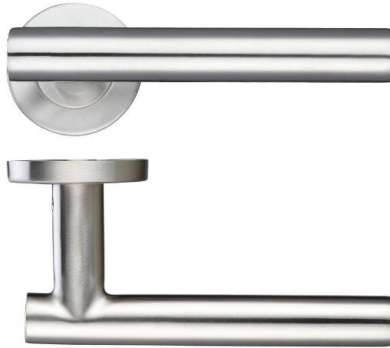
ASP17194 - T Bar Lever