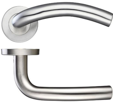
ASP14194 - Arched Lever